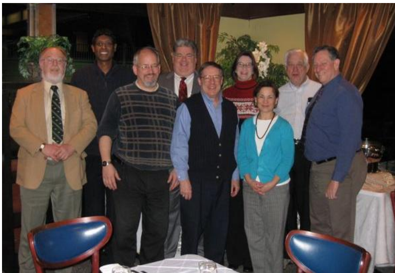
Board members enjoy the February meeting