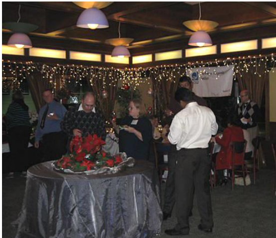
Members enjoy great hors d'oeuvres and conversation at the December meeting